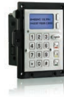
iUP250 Pin pad